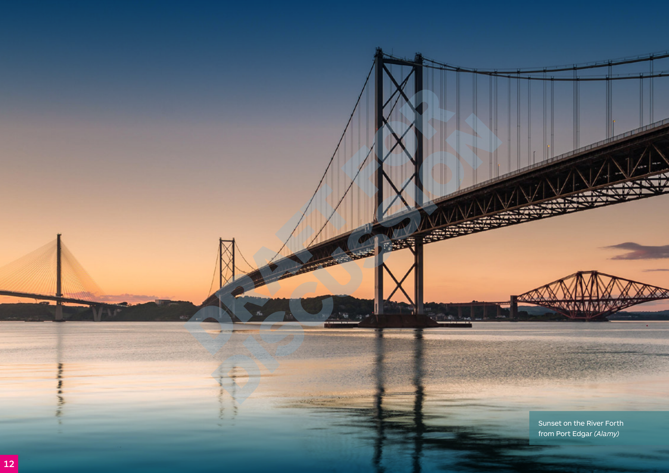
Sunset on the River Forth from Port Edgar