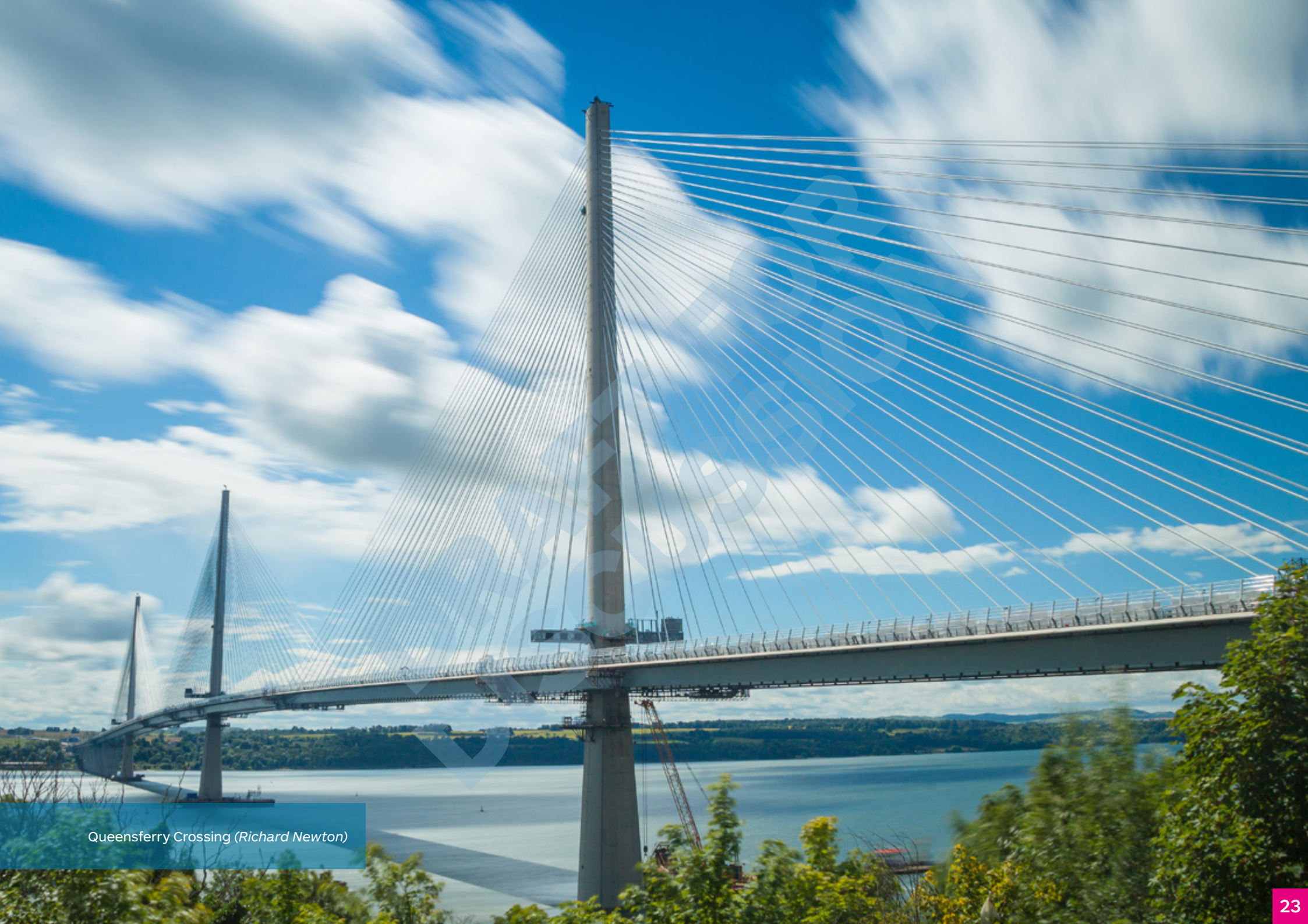
Queensferry Crossing