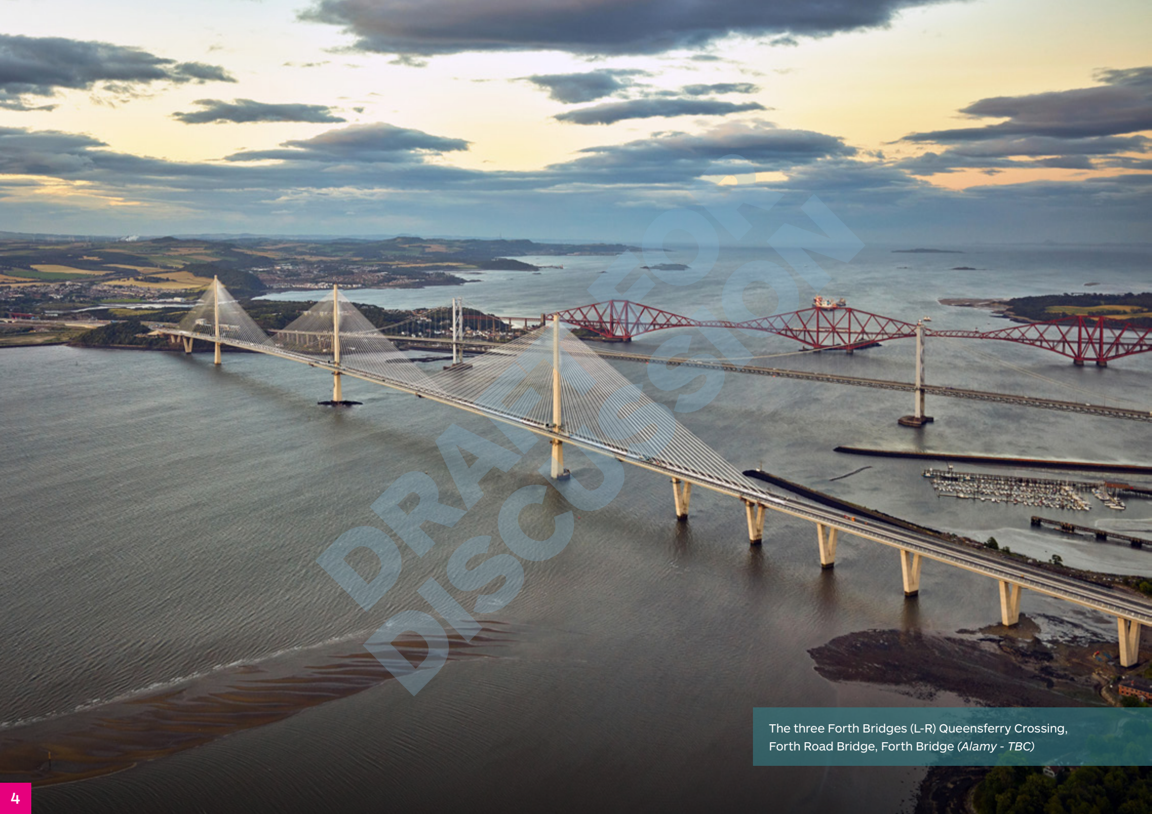
The three Forth Bridges (L-R) Queensferry Crossing, Forth Road Bridge, Forth Bridge