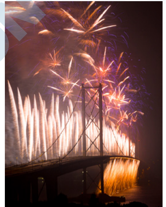
Forth Road Bridge 50th Anniversary Celebrations ( Chris Waite, Amey )