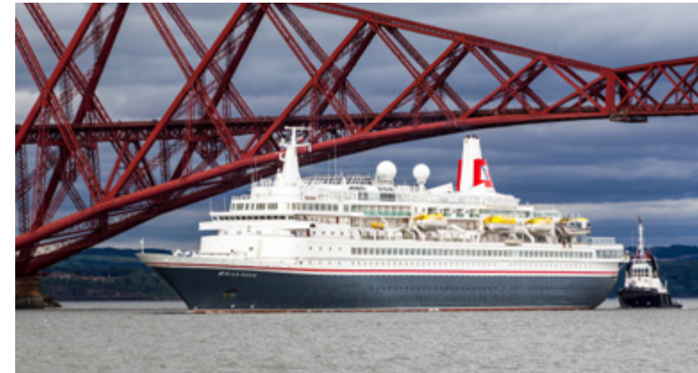
Top: View of the three Forth Bridges at sunrise.. Above: Cruise ship beside the iconic Forth Bridge.