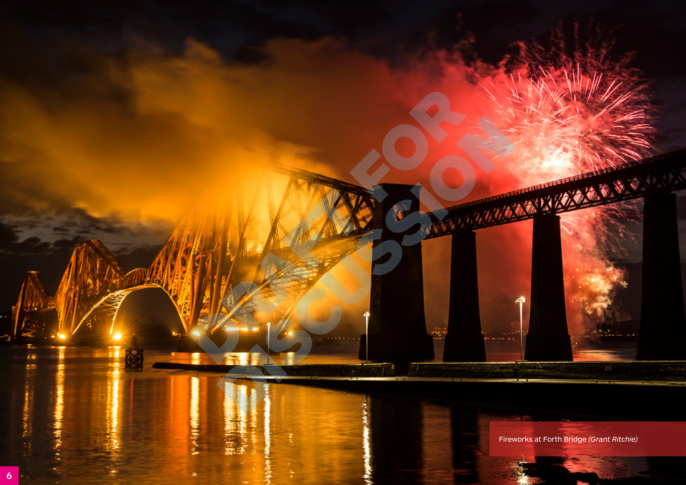
Fireworks at Forth Bridge ( Grant Ritchie )