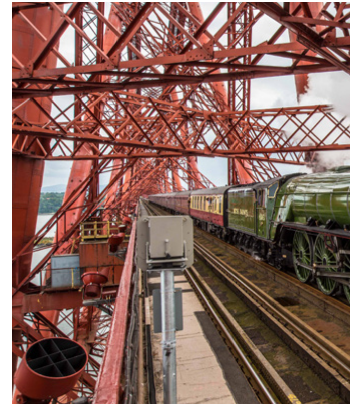
(L-R): Cyclists crossing Forth Road Bridge ( VisitScotland - TBC ), Queensferry Crossing and Forth Road Bridge ( TBC ), Steam engine on Forth Bridge ( TBC ), Forth Road Bridge public event ( Amey )