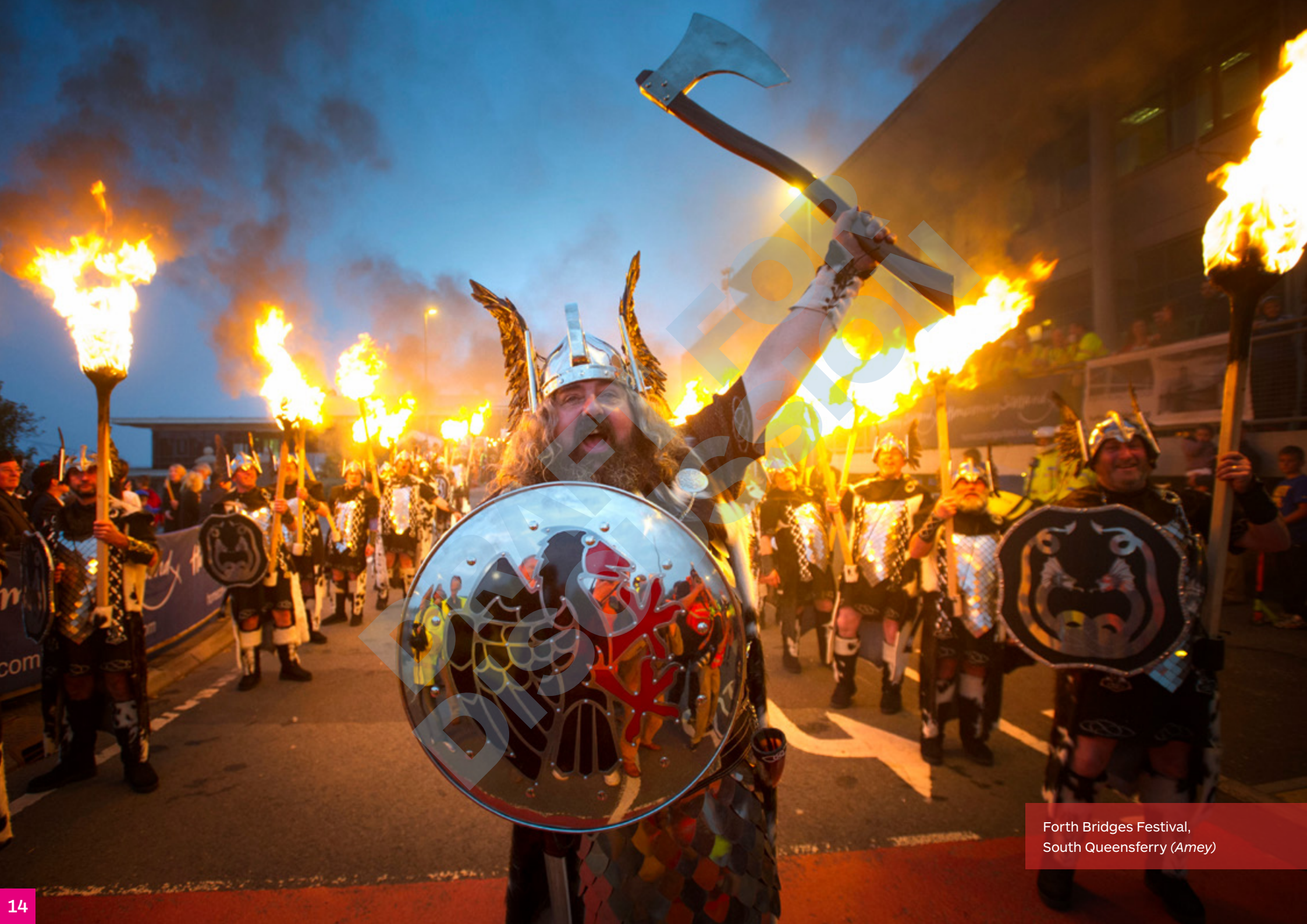
Forth Bridges Festival, South Queensferry (Amey)