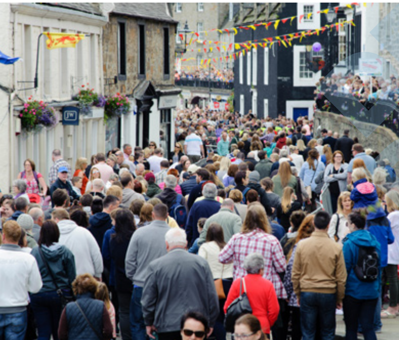
Left: Ferry Fair, South Queensferry