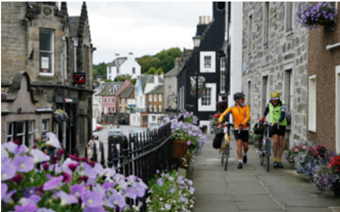
Cyclists in South Queensferry (TBC)